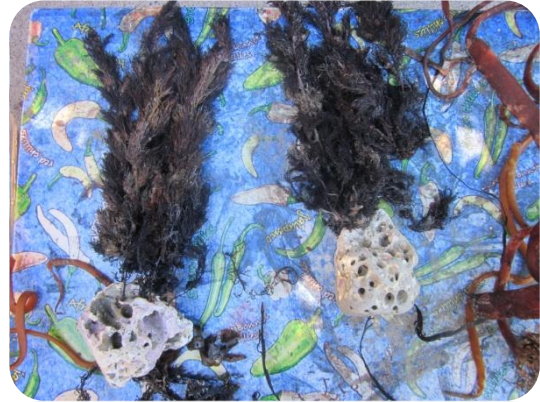
Our seaweed display: Wet and Dry seaweed - there were many different types of seaweed and shells