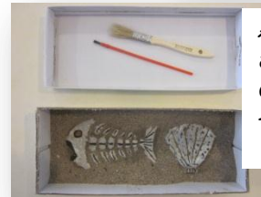
Archeological dig activities. Children enjoyed uncovering the hidden treasures