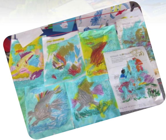
Some of the children's colouring-in pictures